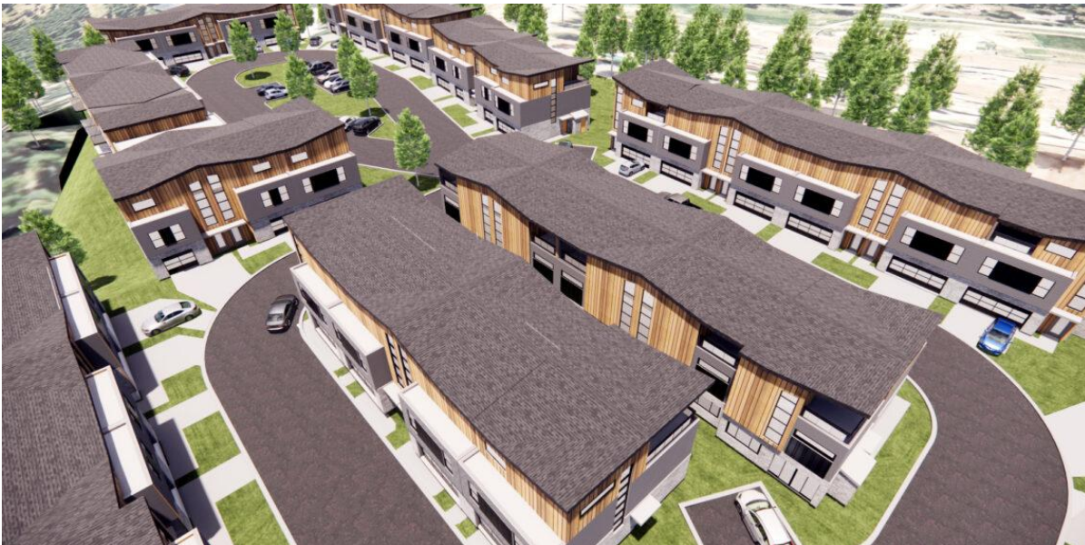
📷 A rendering of Hilltop Townhomes in Evergreen, CO. Credit: HDA